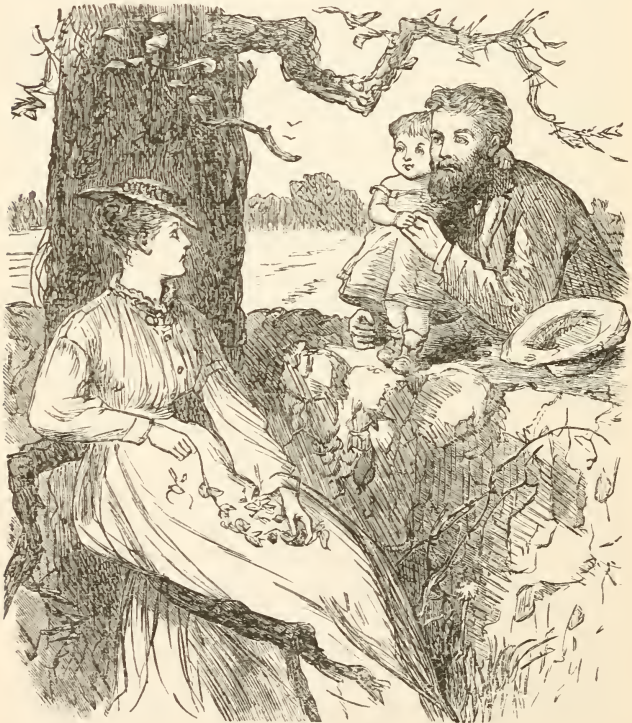
A FRIENDLY CHAT.

David saw her there, and, feeling that he might come off guard for a time, went strolling down to lean upon the wall, and chat in the friendly fashion that had naturally grown up between these fellow-workers. She was waiting for the new supply of ferns little Adelaide was getting for her by the wall ; and while she waited she